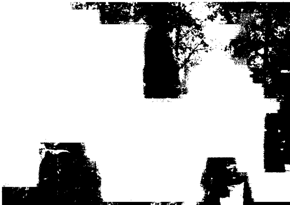
The Jewish Cemetery in Prague. An all-too-chilling reminder of the racist ideals of the Nazi movement.