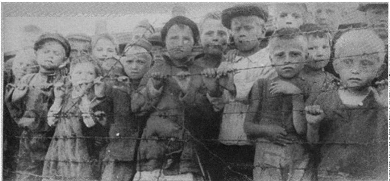
Main Commission for the Investigation of Nazi War Crimes, courtesy of USHMM Photo Archives

'The Jews, labeled subhumans, became nonbeings. It was both legal and right to exterminate them in the collectivist and evolutionist viewpoint. They were not considered